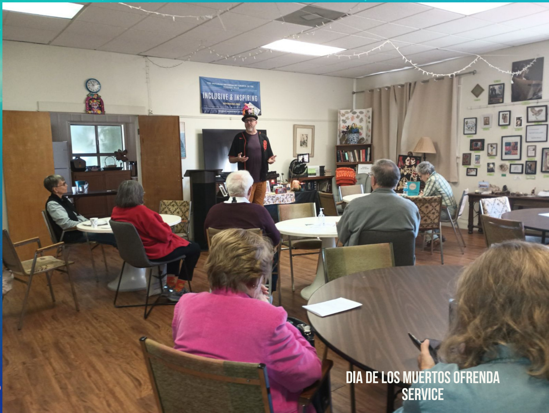
DIA DE LOS MUERTOS OFRENDA SERVICE