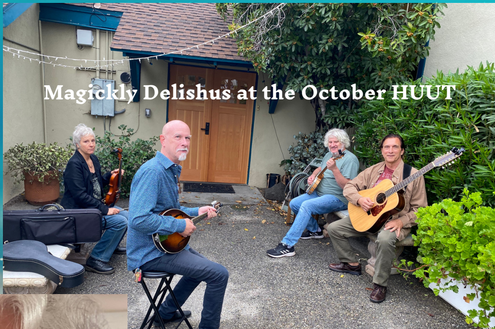
Magickly Delishus at the October HUUT